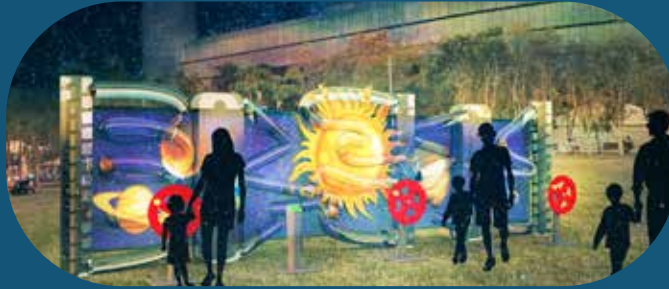
SpaceBalls - a giant outer space marble run