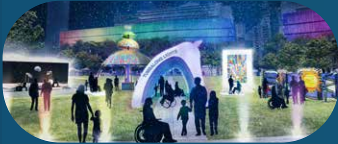
Under the Milky Way - a magical tunnel of stars and outer space