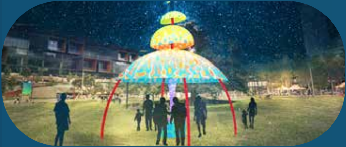
Alien Visitor - a 6m tall Alien that makes sounds and music with you