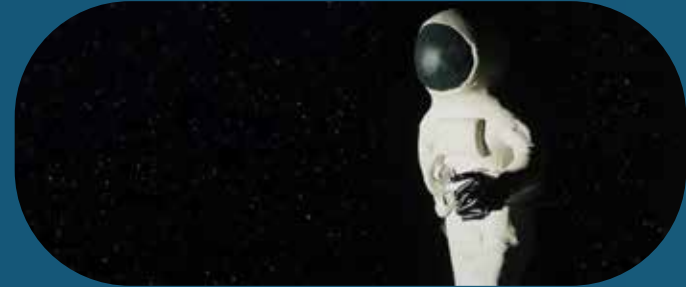
One Giant Leap - a short film about aliens