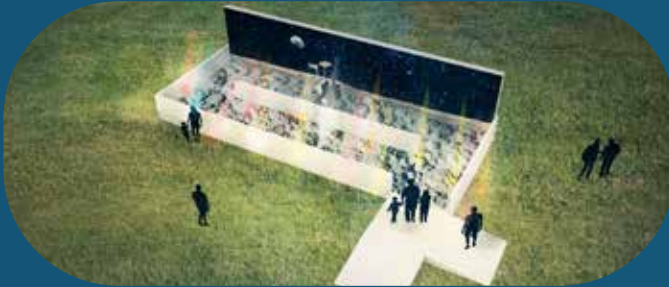
To the Moon and Back - board your lunar buggy and blast off on a virtual trip to the moon