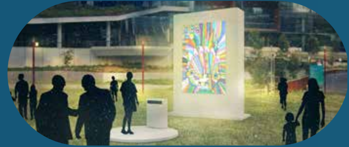
See What I See - Stand in front of the frame and see yourself in a mix of colour and lights